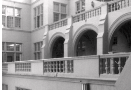
Townsend Center for the Humanities balcony.