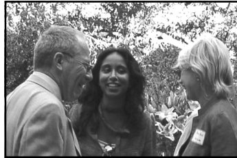
Lively discussion with Fellows and friends at the Center's 2003 Fall Reception