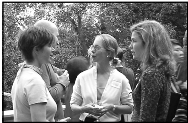
Townsend Center Fall reception, 2003

Contact: Tamao Nakahara, tamao@socrates.berkeley.edu, or Amy Corbin, alcorb@uclink.berkeley.edu October, times and locations TBA. The job market. The group is meeting one to two times per month this fall with new hires and post-docs to peer review job letters, teaching statements, and writing samples.