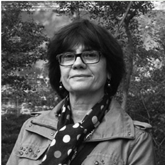
Una's Lecture: Catherine Malabou, see p. 8