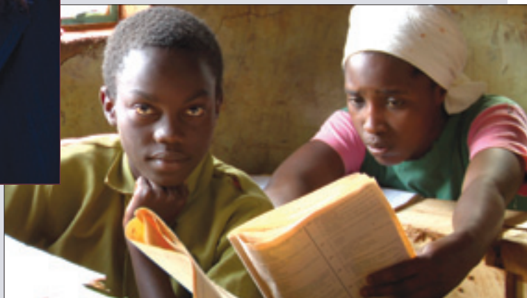
Depth of Field Film + Video Series , see p. 10