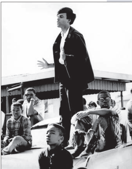
DeFremery Park Exhibit, see p. 3