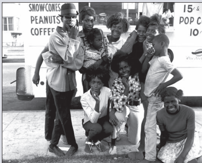
Children in West Oakland