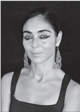
Shirin Neshat Visual Artist