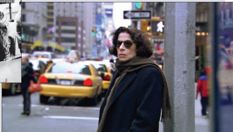
Depth of Field Film + Video Series , see p. 6