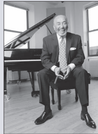
Eddie Palmieri Jazz Pianist