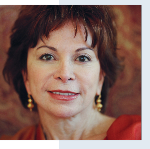
April 6 "Telling Stories" Isabel Allende

WHEN IS ART RESEARCH? TOWNSEND/ MELLON STRATEGIC WORKING GROUP