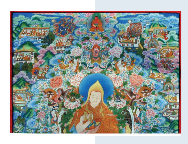
May 5-7 Tibetan Religion and State in the 17th and

TOWNSEND CENTER FOR THE HUMANITIES UC BERKELEY