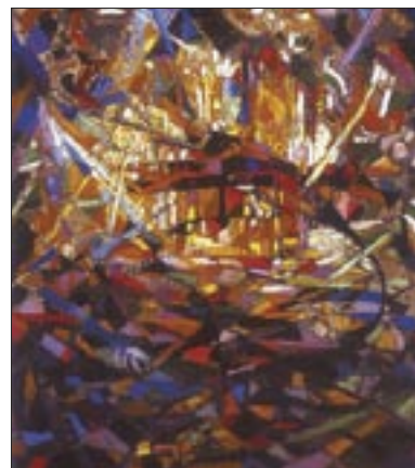
Joseph Stella: Battle of Lights, Coney Island, 1915-18 ; oil on canvas; Sheldon Memorial Art Gallery and Sculpture Garden, University of Nebraska-Lincoln.

Admission is free on the first Thursday of each month. For more information call 510/642-0808 or visit http://bampfa.berkeley.edu