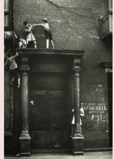
Helen Levitt, New York, 1939

(1890) and The Children of the Poor (1892). A generation later, the camera man and dedicated social reformer Lewis Hine would photograph street children's work and play repeatedly to critique an economic system willing to exploit child labor.