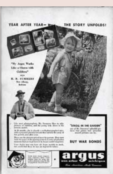
Figure 2: Advertisement from Minicam magazine, vol. 6, March 1943

By focusing her lens specifically on the urban street child, Levitt revived an iconographic tradition that gained significance in nineteenth century realist traditions