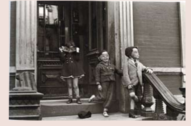
Figure 1: Helen Levitt, New York, c. 1942

looking for the right kind of "material" and "a proper shot," as she puts it, by scouting street life in Brooklyn, the Lower East Side, Harlem, and the Bronx—Levitt uncovered hidden worlds playing out on stoops and sidewalks. The photographs she made early in her career (roughly 1936 to 1950) are preoccupied with