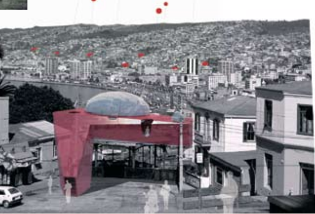
Townsend Center Exhibit: "Plug-in Pavilion, Valparaíso, Chile," see p.23